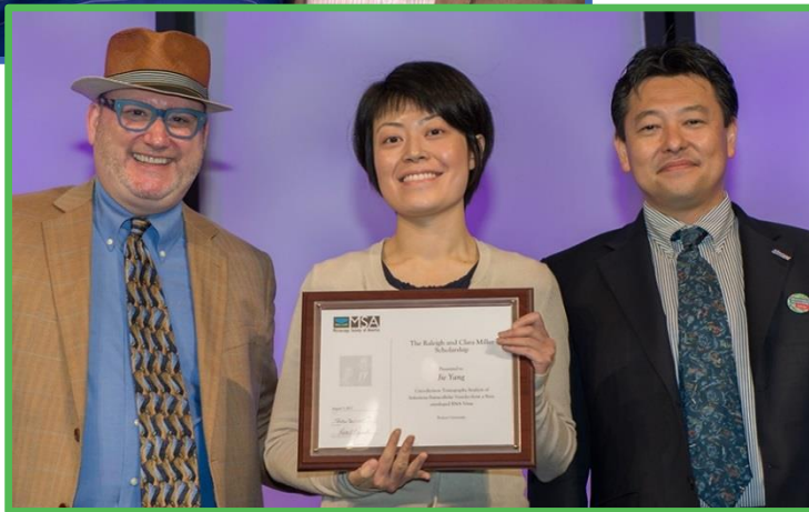
Poster Award Winner & Student Scholar Winner