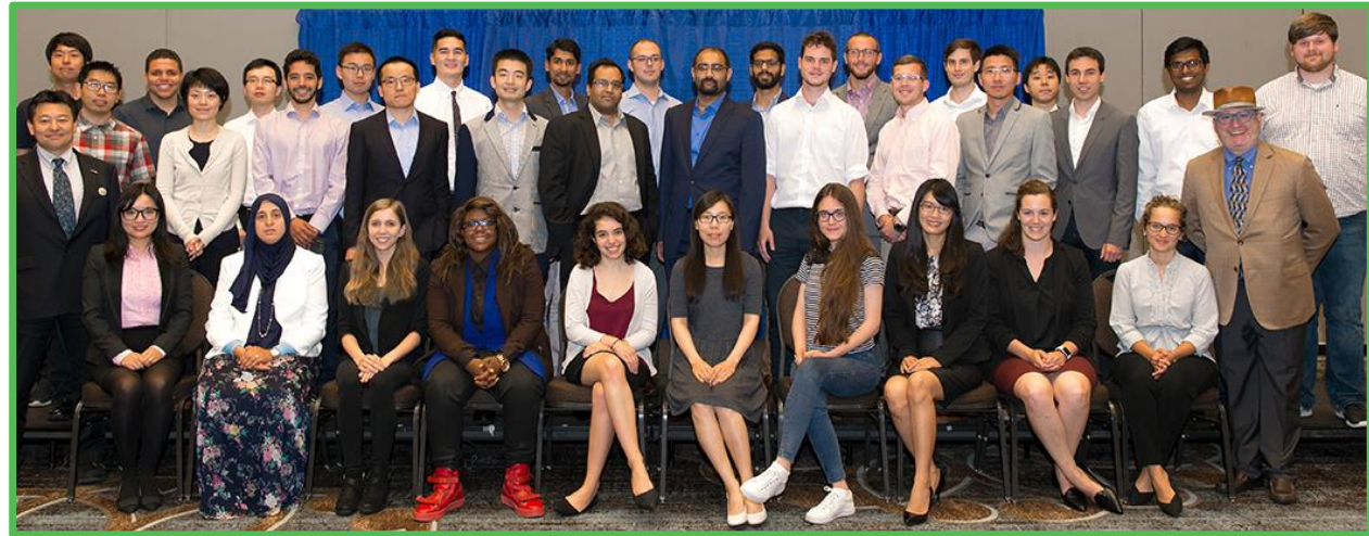
Student Award Winners