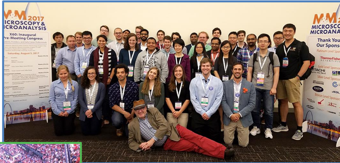
Pre-Meeting Congress Attendees